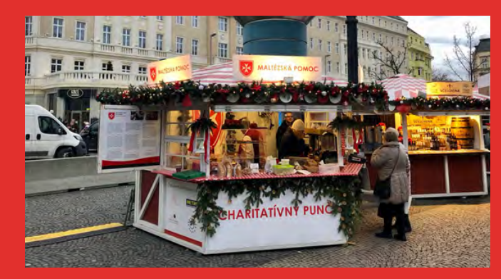
PHOTO: Malteser Charity Christmas Punch, Christmas Markets, Bratislava