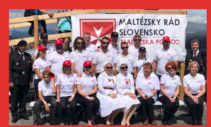
PHOTO: Volunteers in service during the Slovak International Airshow

Besides our regular projects, we always aim to help whenever possible - we were helping during the refugee crisis, we are assisting in hospitals during the pandemic and supplying medical equipment.