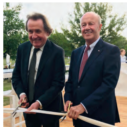
Opening of Grafenegg Festival with Artistic Director Rudolf Buchbinder